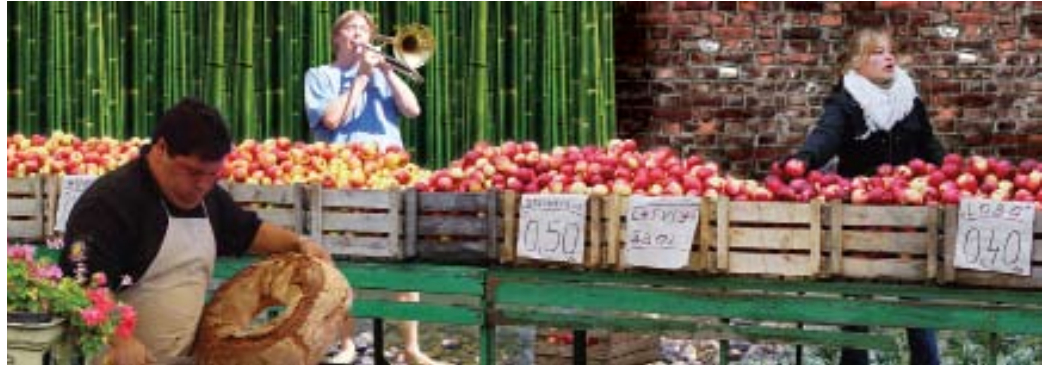
Photographic Collage by Ana Isabel Palacios